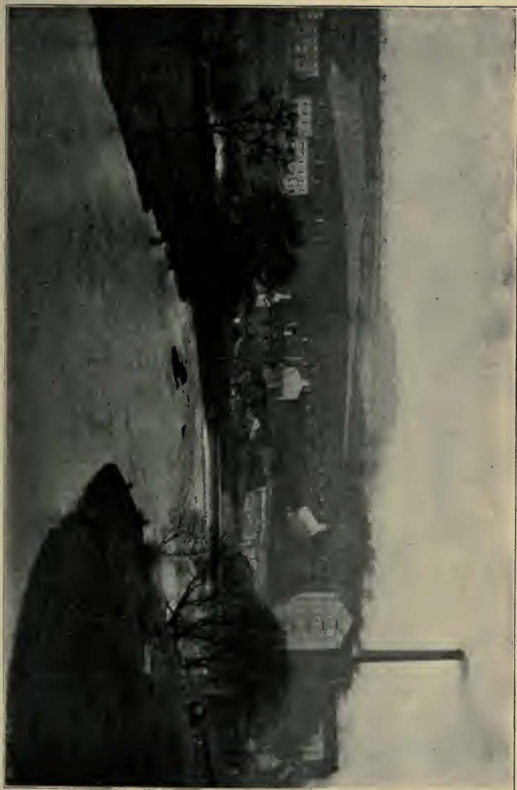
VIEW FROM GRIMSWORTH HALL